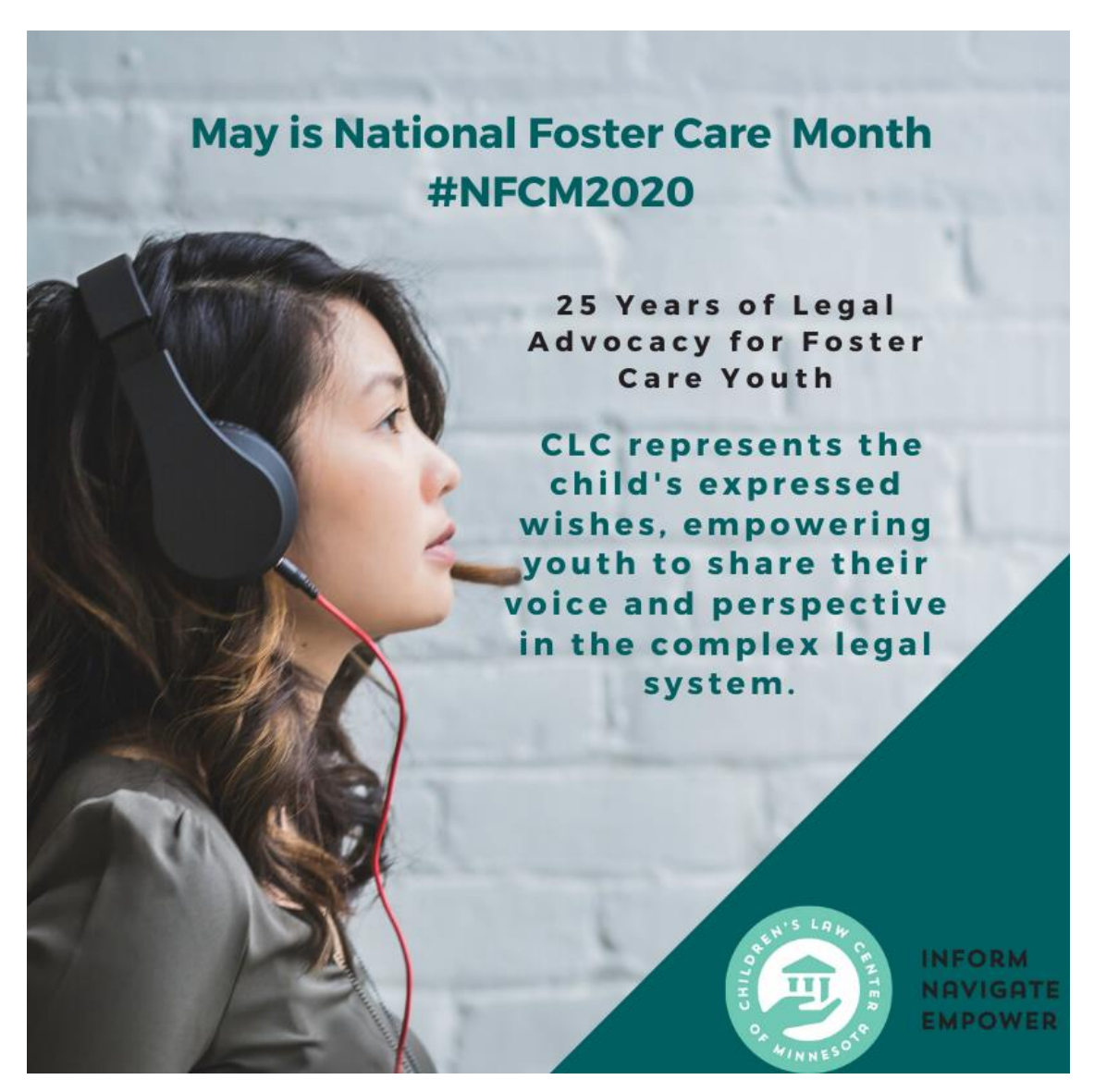
May is National Foster Care Month!#NFCM2020

Help amplify our message by sharing why you advocate for youth in foster care!