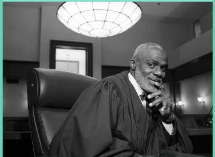
Justice Alan Page - Guest Speaker

The evening will feature a networking cocktail hour, a program celebrating the work of CLC, youth stories, volunteer perspectives, annual awards, a giving moment, and both live and silent/online auctions.