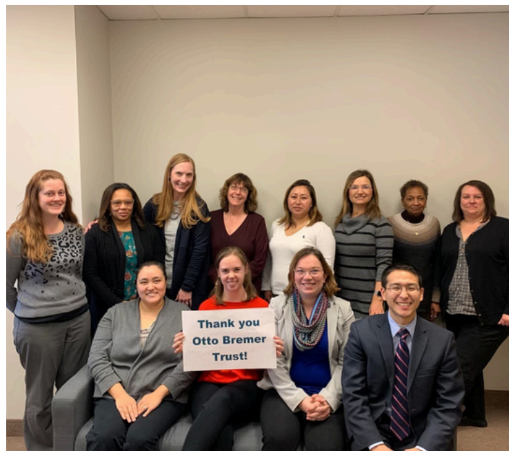
2020 CLC Staff